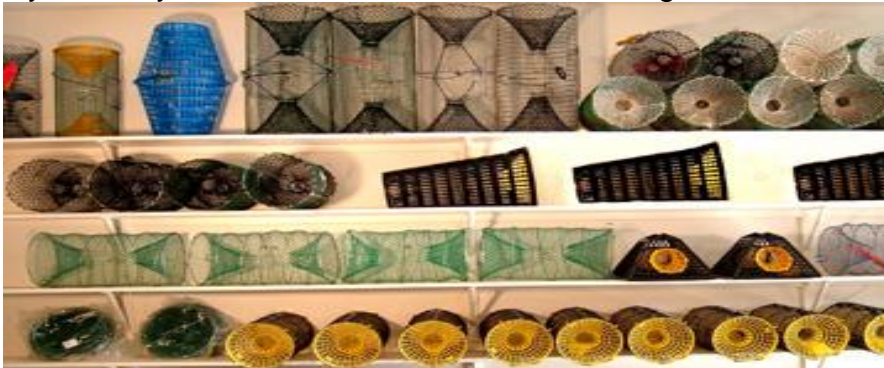
(Above: a collection of different trap designs that all work)

Over the years I have used several types of crayfish traps. Some were good, some not so good. But they all caught crayfish if I only used attractive bait. And there's the rub. Practically any crayfish trap will catch crayfish. All you have to do is to use some good bait.