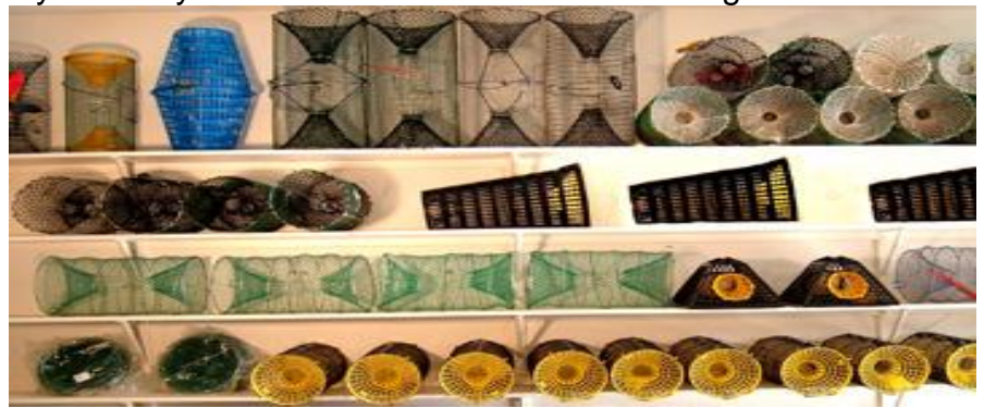
(Above: a collection of different trap designs that all work)

Over the years I have used several types of crayfish traps. Some were good, some not so good. But they all caught crayfish if I only used attractive bait. And there's the rub. Practically any crayfish trap will catch crayfish. All you have to do is to use some good bait.